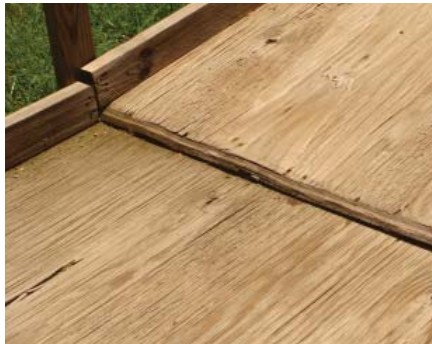
Uneven, bumpy transitions, warped slick surface.