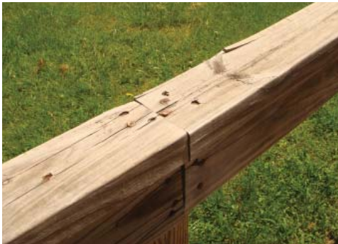
Typical Wooden handrail with exposed nails and splinter hazards