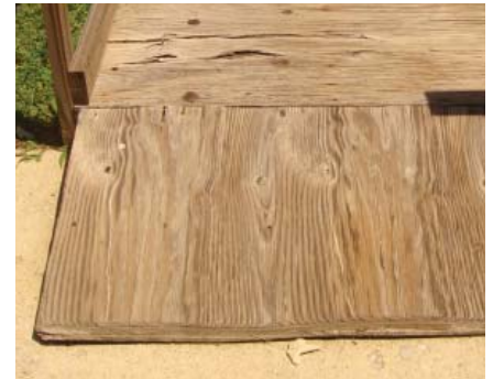
Warped and peeling surface, inch high bump to enter/exit ramp.